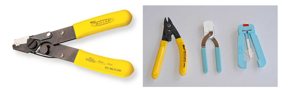
"Miller Stripper" (L) and Miller, No-Nik and Microstrip strippers

Visual Aid: Fiber Optic Stripping Tools (YouTube <a href="http://youtu.be/EdGDklrPmH8">http://youtu.be/EdGDklrPmH8</a>)